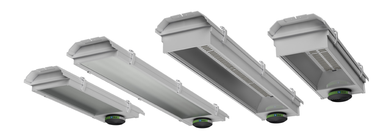
No need to worry about replacement parts!